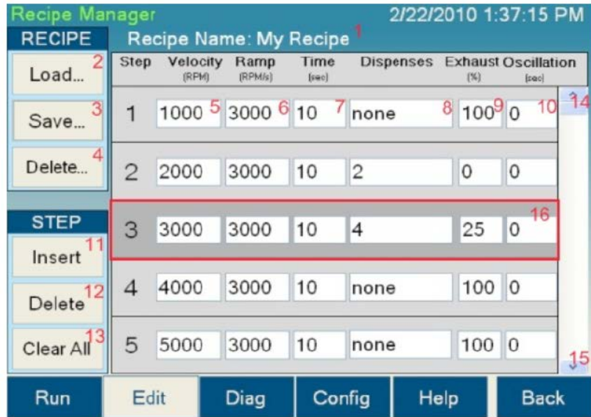
Figure 6: Spin Recipe Edit Screen