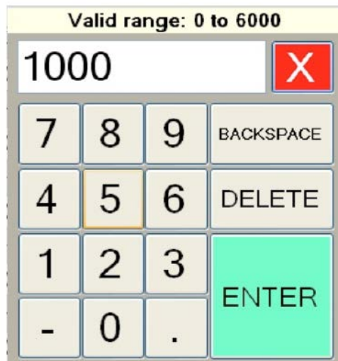
Figure 7: Numeric Pad