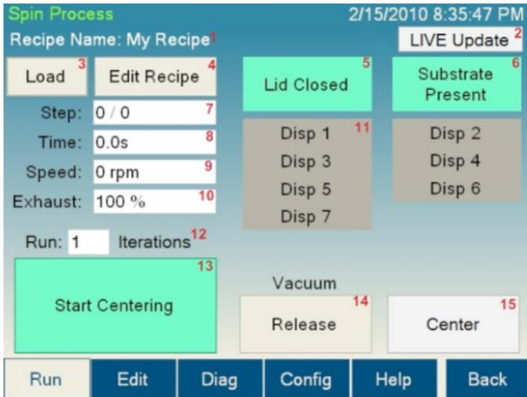
Figure 3: Spin Process Screen

The Spin Process Screen is shown below in Figure 3: