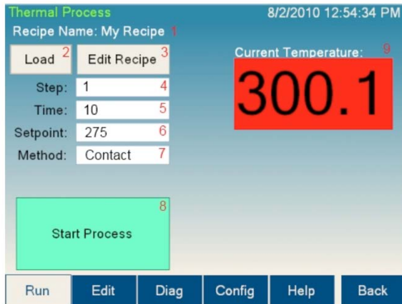
Figure 4: Thermal (Bake) Process Screen

The Thermal (Bake) Process Screen is shown in Figure 4: