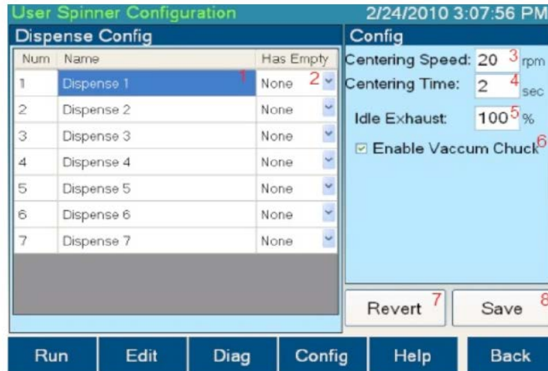
Figure 5: Centering the substrate using the Spin Config screen

Centering Time value. This will occur whether the lid is opened or closed. Once this time has elapsed, pressing the Center icon will restart the centering process