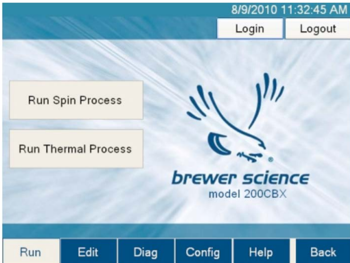
Figure 2: Run Process Screen

The Run Process screen is shown below in Figure 2: