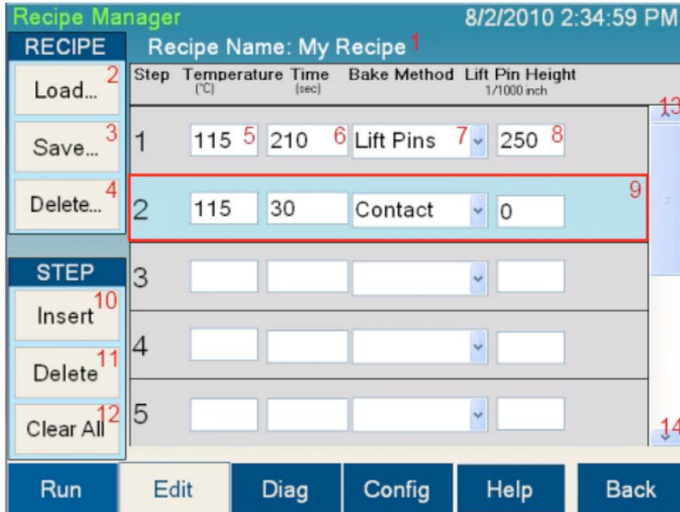
Figure 9: Thermal Recipes Edit Screen